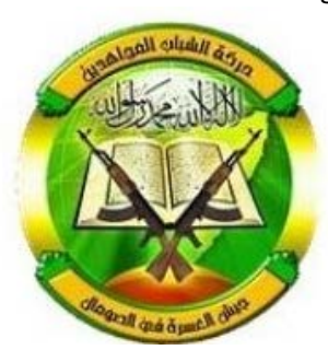
A symbol used by al-Shabaab