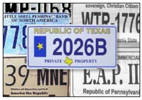
Examples of fraudulent license plates used by Sovereign Citizens

• (U//NP) Animal rights and environmental extremists advocate for criminal behavior as a way to inflict damage upon people, businesses, and overall industries who benefit from what they perceive as the exploitation of animals and/or the environment. It should be made clear that animal rights and environmental extremists are distinct from the mainstream animal and environmental welfare movements due to their promotion of criminal activity as a means to an end. Groups that are part of this movement have engaged in arson, destruction of property, and small-scale bombings. The best-known groups in this category are the Animal Liberation Front (ALF) and the Earth Liberation Front (ELF), both of which have been involved in incidents that caused significant damage and expense.